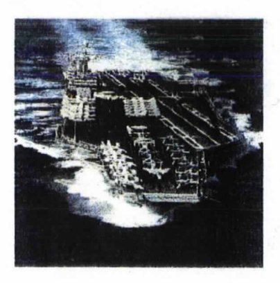
CVN 69 USS Dwight D. Eisenhower