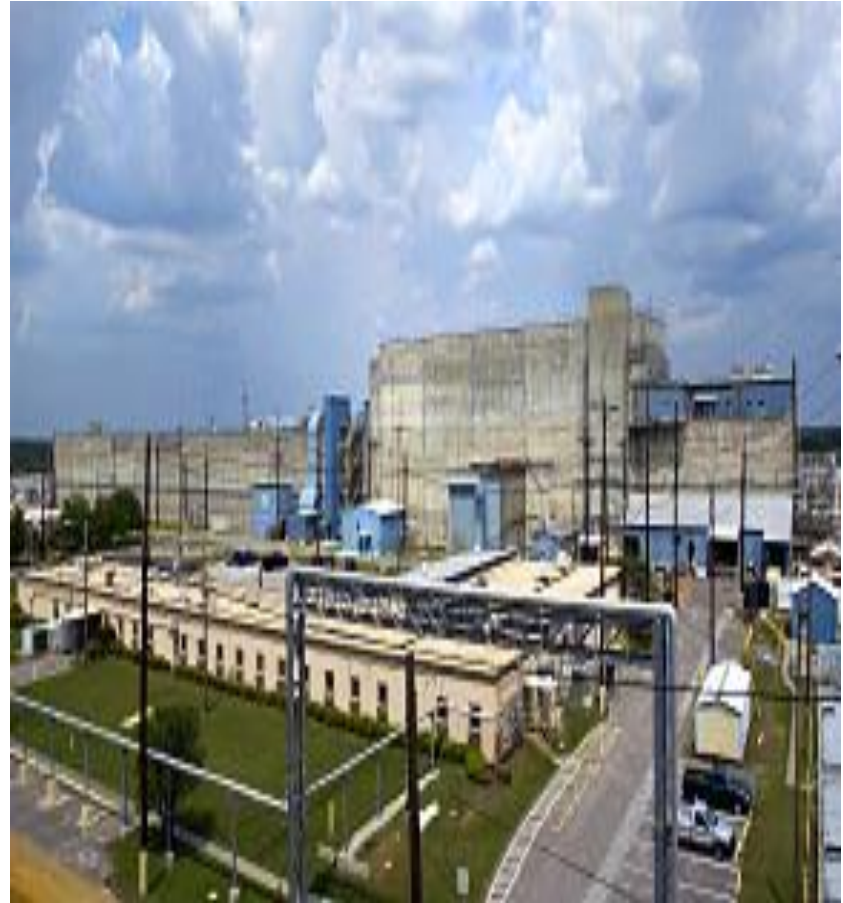
H-Canyon – processing of spent nuclear fuel at Savannah River Site in South Carolina.